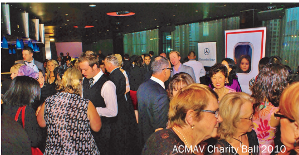
ACMAV Charity Ball 2010