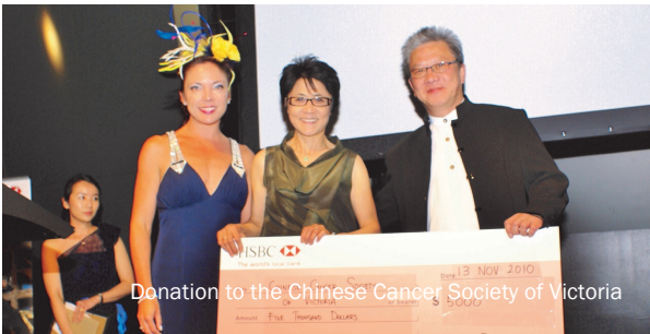
Donation to the Chinese Cancer Society of Victoria