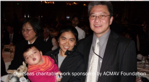
Overseas charitable work sponsored by ACMAV Foundation