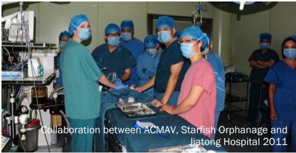
Collaboration between ACMAV, Starfish Orphanage and Jitong Hospital 2011

The society provides a range of psychosocial interventions that help cancer sufferers and their carers cope with a life threatening illness. It also provides community education and resources on cancer in the Chinese language.